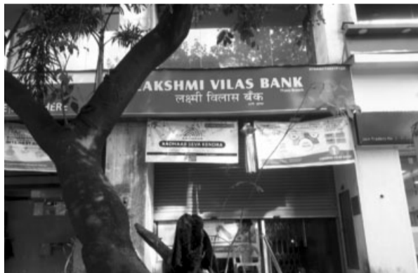
LVB branches started functioning as DBS branches from Friday, though there were no signs of the new identity