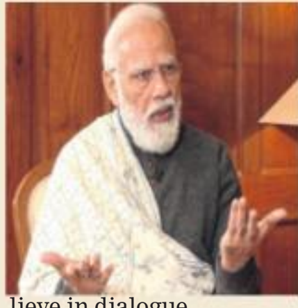
lieve in dialogue. "I don't know the language to attack (someone)

ken on some subjects whenever and wherever it was necessary. In an exclusive interview to ANI, the Prime Minister targeted the former Congress chief and dubbed him as a "person who does not listen and does not sit in the House."