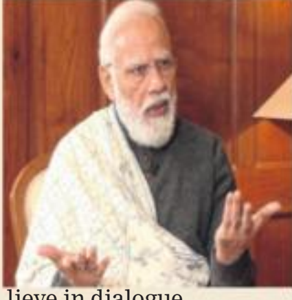
lieve in dialogue. "I don't know the language to attack (someone)

ken on some subjects whenever and wherever it was necessary. In an exclusive interview to ANI, the Prime Minister targeted the former Congress chief and dubbed him as a "person who does not listen and does not sit in the House." Stressing that he welcomes debate in Parliament, PM Modi said that he and his government do not attack anyone and be-