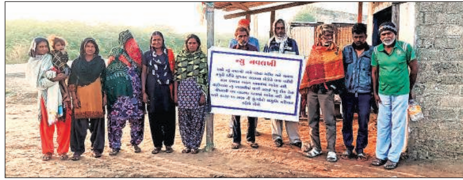
Residents of New Navlakhi in Morbi constituency boycott the by-elections on Tuesday.