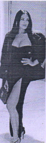
Esha Gupta keeps it graceful.