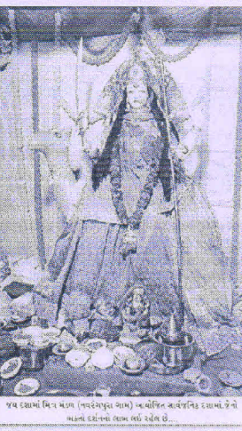
વૈષ્ણવ મિત્ર મંત્રાલય (વલ્લભજીવન મંત્રાલય) ની મુખ્ય મથકમાં ભગવાન શ્રીકૃષ્ણની સ્થાપતિ કરવામાં આવી.

ગોદેરજ એન્ડ બોય્સ જર્મનીના સંયુક્ત સાહસ પાર્ટનર કોર્બર સપ્લાય ચેઇન સાથે ભાગીદારી.