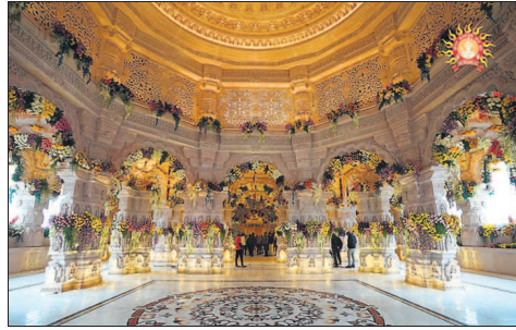
The consecration ceremony of the Ram temple is set to be held on January 22 in Ayodhya.