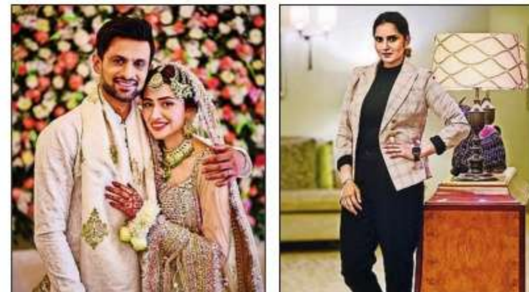
Shoaib Malik with his new wife Sana Javed; Sania Mirza (right)

Islamabad: Amid swirling speculation about his separation from tennis player Sania Mirza, former Pakistan cricket captain Shoaib Malik, 41, officially announced Saturday his third marriage to actor Sana Javed, 30. The couple revealed that they had recently tied the knot in a private ceremony in Karachi, sharing glimpses of their union on Instagram.