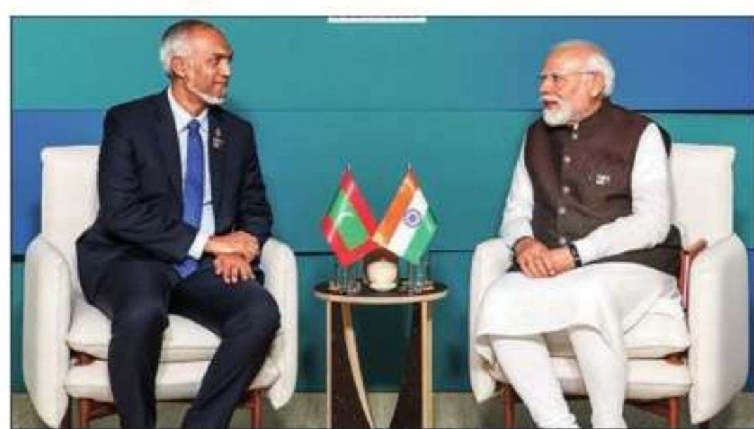
A file photo of Maldives president Mohamed Muizzu with PM Modi. Muizzu has asked India to pull out its troops by March 15

New Delhi: A 13-year-old child died in the Maldives because of a delay in providing him treatment that was caused by the alleged reluctance of the Maldivian government to use Indian choppers for medical evacuation, according to the Maldivian media. India had earlier provided two naval choppers and a Dornier aircraft for medical evacuation and other High Availability Disaster Recovery (HARD) activities.