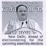
New Delhi, Ahead of electing new leadership for the upcoming assembly elections

In Bihar, BJP chief JP Nadda on Saturday chaired a virtual meeting, in which party leaders in the State who are MPs were present. Bihar BJP President Sanjay Jaiswal said that every MP will visit two constituencies every day from September to prepare for the elections. Jaiswal further said that all the MPs will also meet the district officials separately. "There will be virtual