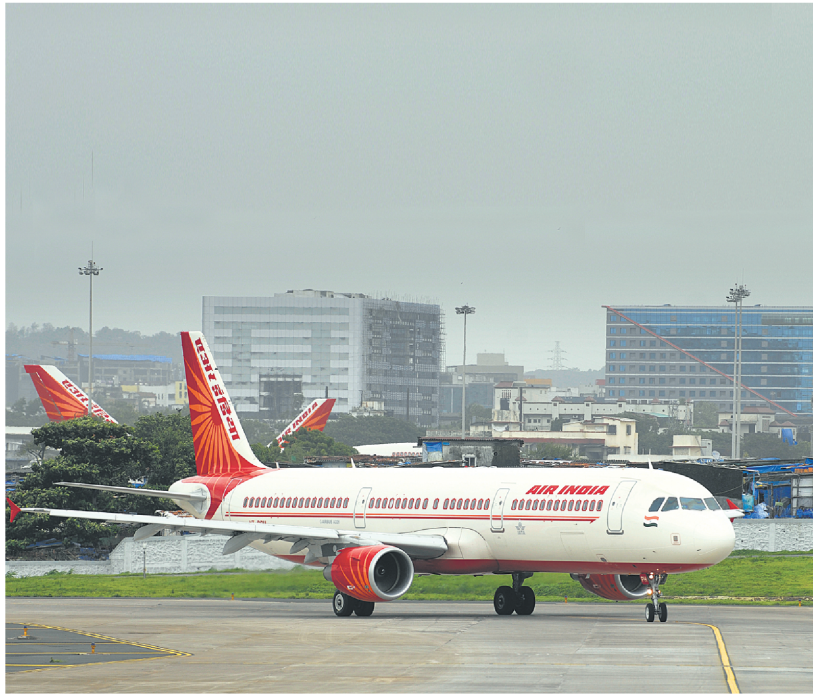
The government aims to conclude 100% divestment of Air India before the end of this fiscal year through March.

by Air India to offset the debt of Air India Ltd," he said.