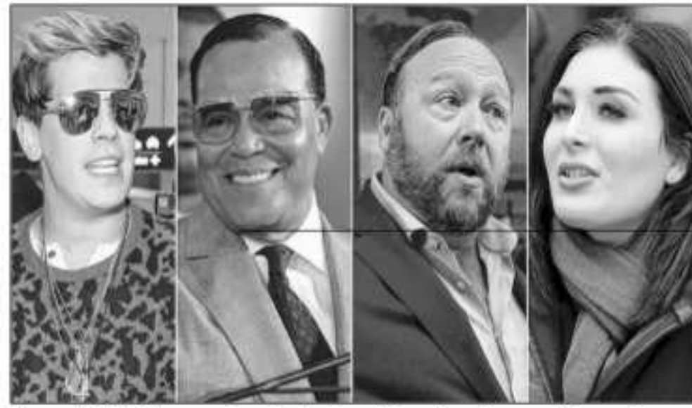
(From L) Milo Yiannopoulos, Louis Farrakhan, Alex Jones and Laura Loomer