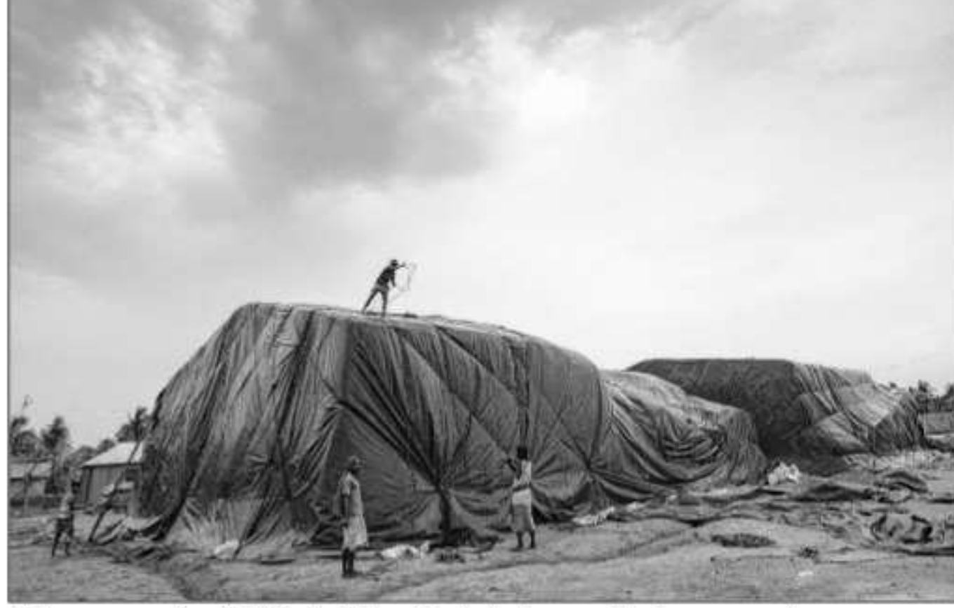
Workers cover a pile of fertiliser in Khulna, Bangladesh, even as the storm approaches.

ANISUR RAHMAN Dhaka Bangladesh on Friday evacuated over five lakh people from its southwestern districts as cyclonic storm 'Fani', brewing over the Bay of Bengal, is drawing closer and is likely to hit the country late night and cause severe damage after ravaging the Indian coastlines. The India Meteorological Department (IMD) has classified 'Fani' as an "extremely severe cyclonic storm". Met office spokesman Omar Faruque said the cyclone is likely to "enter Bangladesh through Khulna coastlines and will take the entire night to cross the country, ravaging southwestern" coastline districts. Bangladesh skyline turned dark in many parts of the country since noon as 'Fani', dubbed to be the deadliest cyclone in decades to hit the region, started approaching, albeit with a weakened force, after ravaging India's eastern Odisha coastlines, weather officials said.