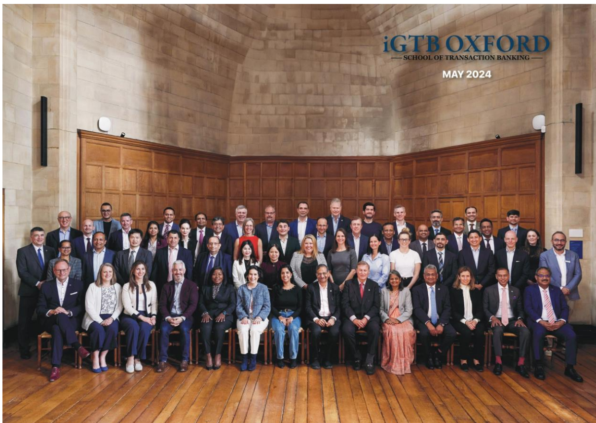
Participants and speakers of the 10th Jubilee celebration of the iGTB Oxford School of Transaction Banking at Oxford University, where global thought leaders convened for a high-impact executive learning experience.

This year's exclusive immersive learning experience, which started in Oxford and culminated at the Oxford and Cambridge Club in London, attracted over 40 participants and 20 distinguished speakers from six continents. The assembly underscored the global influence and outreach of the iGTB Oxford School, solidifying its status as a central hub for significant industry advancement.