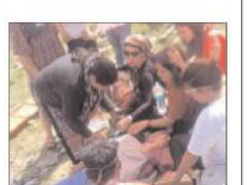
हादसे का शिकार इजराइली महिला को संभालते लोग।

घटना के तुरंत बाद महिला को उपचार के लिए केलांग अस्पताल