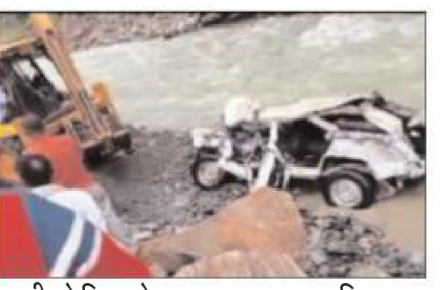
गाडी को निकालने का प्रयास करता प्रशासनिक दल

जानकारी के मुताबिक मंगली निरीक्षण चौकी पर तैनात जवानों का यह दल गश्त के बाद भंजराड़ मुख्यालय लौट रहा था। इस दौरान तरवाई के पास सूमो गाड़ी अचानक पहाड़ से हुए भूस्खलन के चट्टानी मलबे की चपेट में आ गई। हादसा इतना भयानक था कि नाले में गिरने के बाद गाड़ी के परखच्चे उड़ गए। इस दौरान तीन लोग गाड़ी से छिटककर चट्टानों से टकराए। इससे उन्हें गंभीर