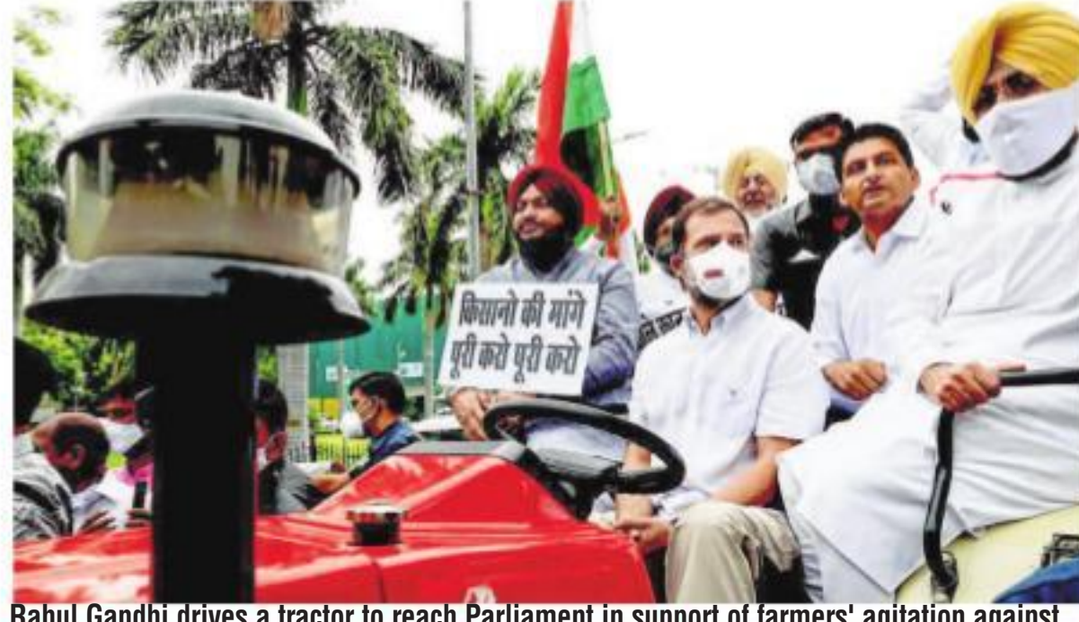
Rahul Gandhi drives a tractor to reach Parliament in support of farmers' agitation against Centre's farm reform laws during Monsoon session, in New Delhi, on Monday

Targeting the government, the Congress MP from Kerala's Wayanad said, "As per the government, farm-