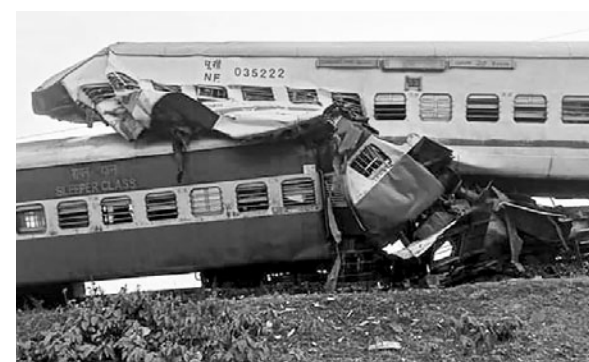
Mangled remains of Guwahati-Bikaner Express after it derailed in West Bengal's Jalpaiguri on Thursday

The price of a domestic LPG cylinder has been unchanged at ₹899.50 apiece from October 2021.