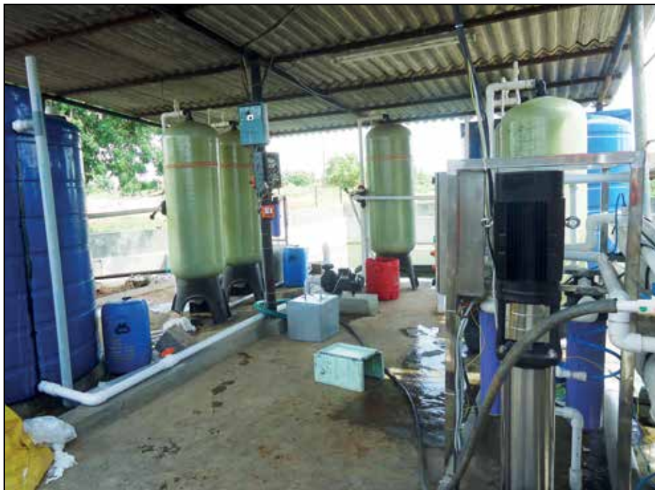
Water Treatment & Recycling Plant @ Kalwakurthy Unit