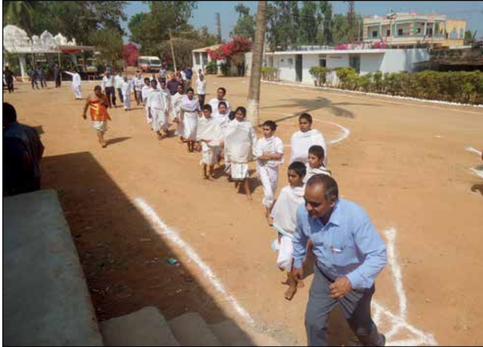
Students of Gayathri Veda Vidyalam - Under CSR Activities