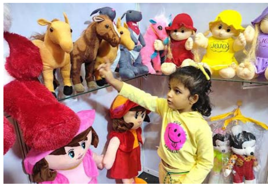
International Toy Exhibition at Netaji indoor Stadium on Saturday.

The officer said raids will continue to keep a check on the black marketing of tickets. "Our officers are alert and raids will continue," the officer told PTI. The complainants alleged that certain BCCI and CAB officials, along with the online ticket booking portal, intentionally reserved a good number of tickets meant for the general public and made those available to black-marketers. A senior CAB official rubbished the allegations and said they were only hosting the match and had no involvement in the selling of tickets which was looked after by the portal and the International Cricket Council (ICC). (PTI)