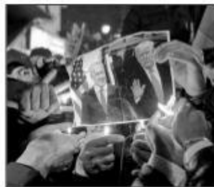
Protesters burn pictures of Donald Trump and Israel's PM Benjamin Netanyahu.

TEHRAN: Iranian Foreign Minister Javad Zarif on Tuesday called the Middle East plan unveiled by US President Donald Trump as a "nightmare for the region".