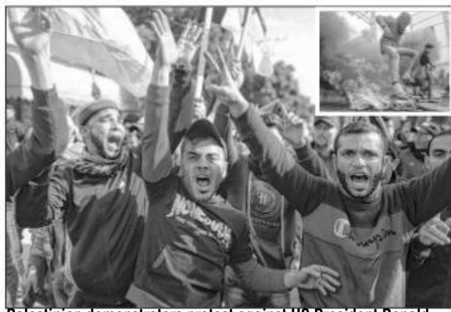
Palestinian demonstrators protest against US President Donald Trump's peace plan in Gaza City on January 28, 2020.

vided" capital, rather than a city to share with the Palestinians. The plan also lets Israel annex West Bank settlements. However, the Palestinians angrily rejected the entire plan.