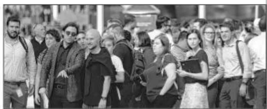
People wait outside after evacuating office buildings due to earthquake in south of Cuba on January 28.

A major 7.7 magnitude earthquake struck Tuesday in the Caribbean between Jamaica and Cuba, triggering a brief tsunami alert and sending hundreds of people pouring onto the streets of Havana.