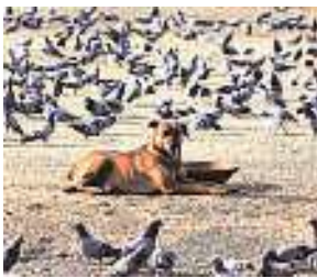
Details like date of a dog's surgery and release will be updated online.