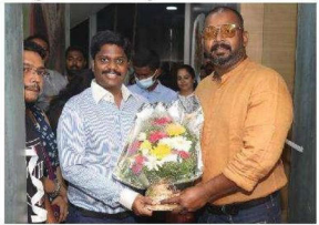
Paulsons Beauty and Fashion opens new outlet in Ramapuram

BBA - Health and Hospital Administration The Sankara Nethralaya Academy, Chennai offers three-year BBA - Health and Hospital Administration and two-year MBA and MHA Hospital Management and Health Care Administration.