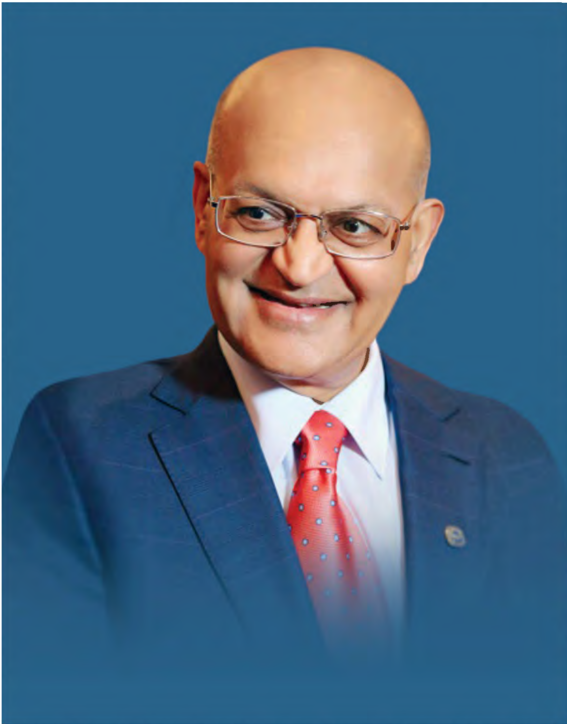
Hon'ble Shri Abhey Kumar Oswal