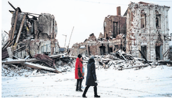
Pedestrians walk past a destroyed building in Kupiansk, Kharkiv region, on Monday

Ukraine officials said that one marine brigade of 5,000 men was almost entirely destroyed, for the third time