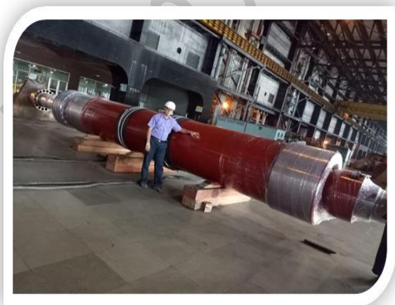
Rectification of Electrical Ground Fault in a 500 MW, 21KV, 3000 RPM, Hydrogen & Water Cooled Turbo Generator Rotor at Site