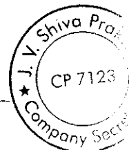
V SHIVPRAKASH CP No 7123