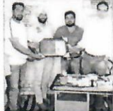
ਮੁਫ਼ਤ ਜਾਂਚ ਕੈਂਪ 'ਚ 114 ਮਰੀਜ਼ਾਂ ਦੀ ਜਾਂਚ ਹੋਈ।

ਮੁਫ਼ਤ ਜਾਂਚ ਕੈਂਪ 'ਚ 114 ਮਰੀਜ਼ਾਂ ਦੀ ਜਾਂਚ ਹੋਈ। ਮੁਫ਼ਤ ਜਾਂਚ ਕੈਂਪ 'ਚ 114 ਮਰੀਜ਼ਾਂ ਦੀ ਜਾਂਚ ਹੋਈ।