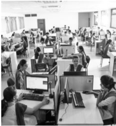
CM Adityanath said such programmes could be vital in preparing youths for jobs and contributing to the state's progress

Such training programmes are being funded from the state exchequer as well as via tie ups with private companies such as the ‘Samsung Innovation Campus’ programme. “UP is taking steps to combine the talent of youth with technology and training... the programmes for artificial intelligence, internet of things, big data, and coding skills are essential in preparing youths for the future,” Adityanath said. He observed that such skilling programmes could play a vital role in preparing the youths for jobs and contributing to the state's development. Meanwhile, the UP government is