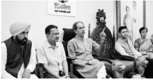
Shiv Sena (UBT) chief Uddhav Thackeray (center) with Delhi CM Arvind Kejriwal and Punjab CM Bhagwant Mann in Mumbai

Dal (BJD), Telugu Desam Party (TDP), YSR Congress (YSRCP), and Bahujan Samaj Party (BSP) will attend the ceremony, becoming the only non-NDA parties to attend.