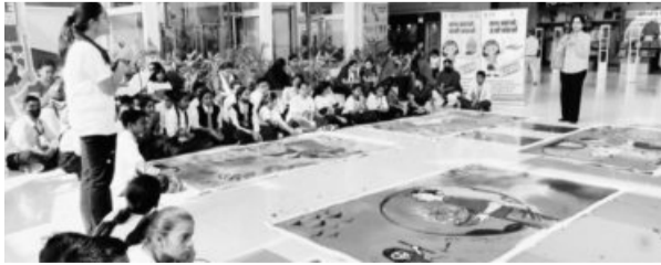
State environment conservation board's eco-club students painted a 3,600-sq-ft canvas with eco-friendly cow dung paint

The Chhattisgarh Environment Conservation Board (CECB) organised a painting campaign on “Lifestyle for the Environment (LiFE)” on the occasion of Earth Day 2023 in Raipur. The themes of the painting included “say no to single-use plastics”, “no littering”, “switch off electrical devices when not in