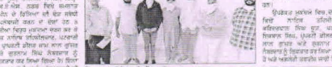
ਪਟਵਾਰੀ, ਨੰਬਰਦਾਰ ਤੇ ਪ੍ਰਾਪਰਟੀ ਡੀਲਰ ਗ੍ਰਿਫ਼ਤਾਰ... ਪਟਵਾਰੀ, ਨੰਬਰਦਾਰ ਤੇ ਪ੍ਰਾਪਰਟੀ ਡੀਲਰ ਗ੍ਰਿਫ਼ਤਾਰ...