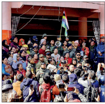
COMPELLED TO TAKE OATH

Guwahati: Three MLAs, two from the ruling BJP and one from the Congress, were beaten up and compelled to take an oath by radical armed Meitei group Arambai Tenggol at Kangla Fort in Imphal on Wednesday. The incident happened at an ethnic meeting of legislators called by the extremists. How an ethnic meeting was allowed by the Biren Singh government after the state has experienced ethnic violence since last May had not been questioned so far.