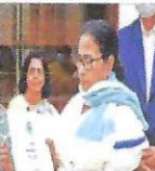
West Bengal CM Mamata Banerjee with the state budget FY25 ahead of its presentation in the state assembly in Kolkata on Thursday.

"I propose a budget of ₹3,66,166 crore for the financial