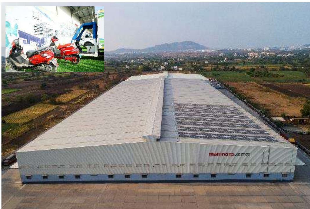
Solar Powered Warehouse & EV Charging Station at Pune

EDeL completed nearly 7 million “clean” kilometres saving over 1,000 tonnes of CO2 emission