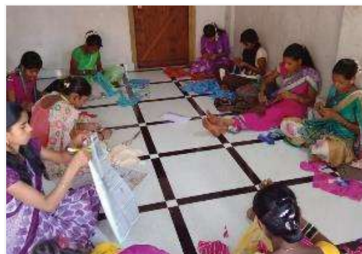
Skill development and scholarships