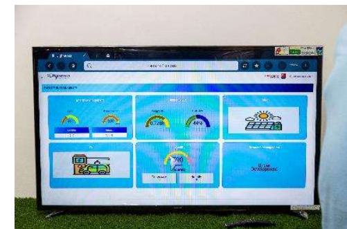
Energy Management & Sustainability Dashboard in Warehouses