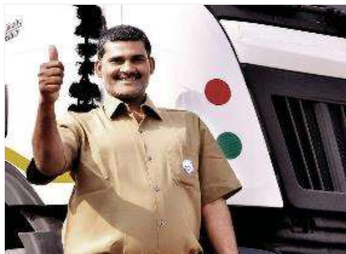
Samantar - Driver welfare programme