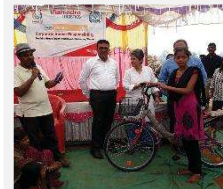
Urban and rural community engagement programmes