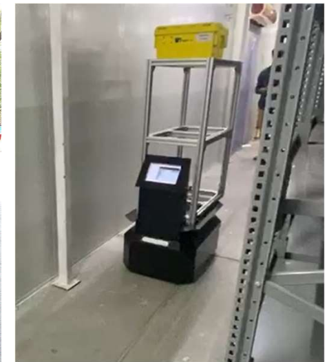
Robot assisted order picking

Catapult 2.0 saw a participation of over 100 start-ups