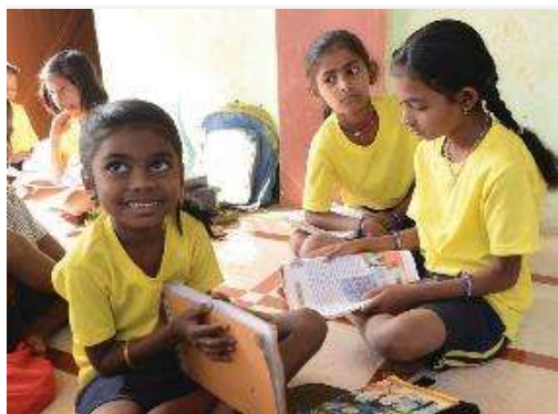
Contribution to Nanhi Kali