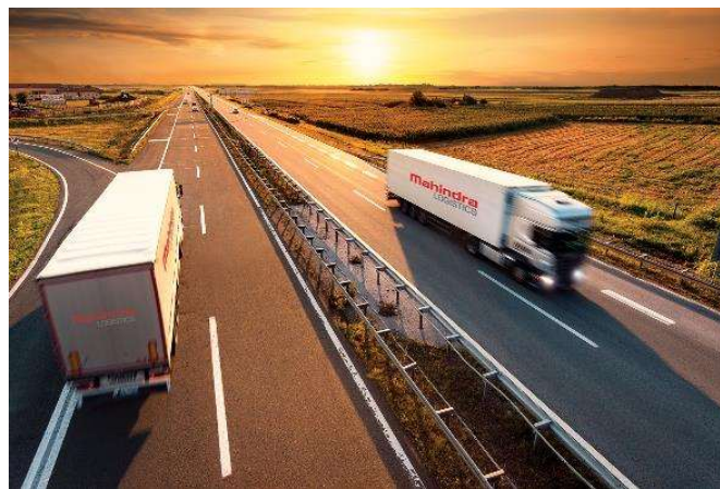
Network Transportation Services