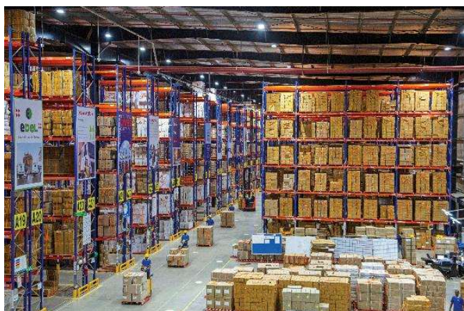
Core 3PL Integrated Solutions

Our endeavour is to orchestrate continuous value and impact for our stakeholders, thus inspiring and igniting success for all.