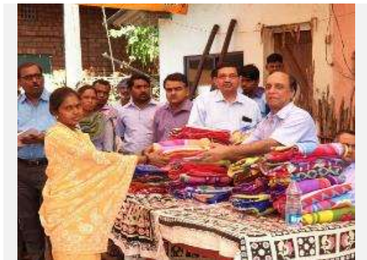
Disaster relief and rehabilitation