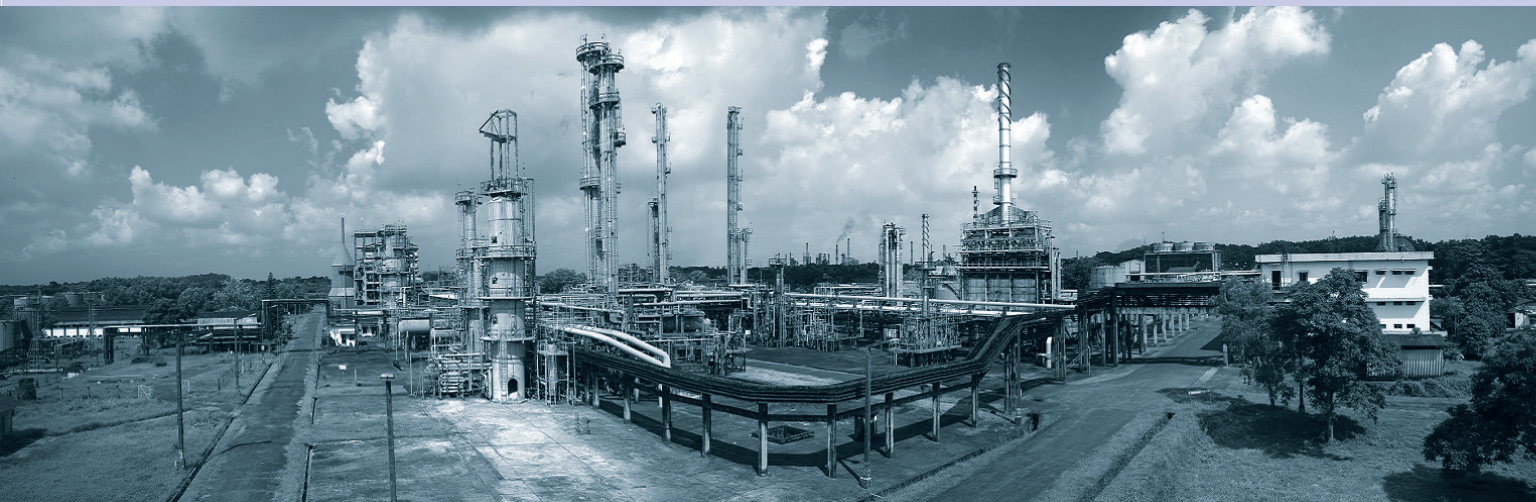
Phenol Complex at Kochi