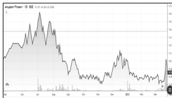
Anupam Finserv Ltd