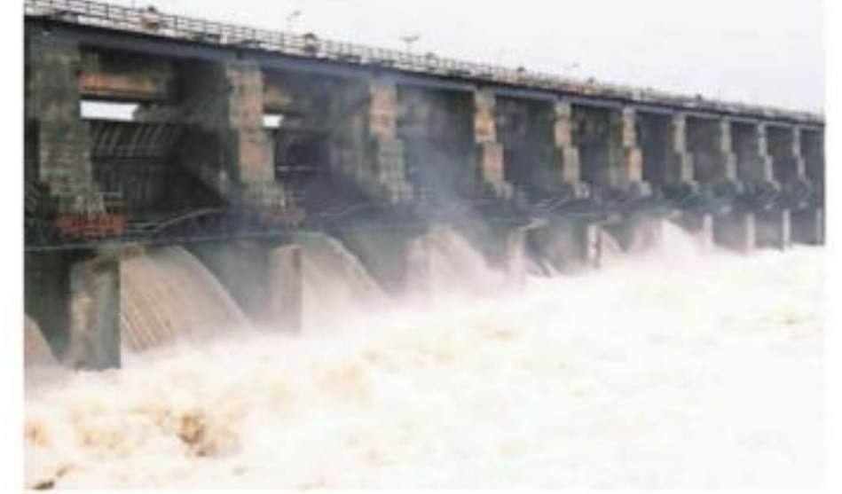
Of the 20 dams in Kutch, 13 are full and the region has a total storage of 226.68 MCM (million cubic metre), up from 62.14 MCM gross water recorded on June 29. File

In Central Gujarat, which received heavy rain in districts like Chhota Udepur and Panchmahal, 17 dams recorded a total percentage filling of 42.81 per cent with a gross storage of 992.81 MCM on Thursday,