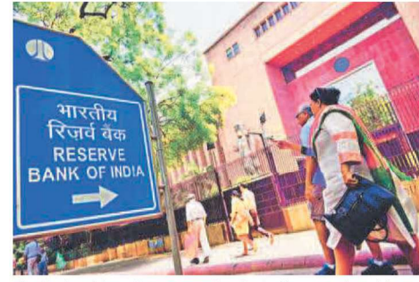
The National Asset Reconstruction Co. Ltd has met the minimum capital criteria of ₹100 crore as per RBI rules.

On 29 June the Indian Banks' Association (IBA), entrusted with the task of setting up the bad bank, has pegged the government guarantee at around ₹3,000 crore. The idea is that NARCL would buy bad loans at 15% cash and the remaining 85% would be in security receipts guaranteed by the government.