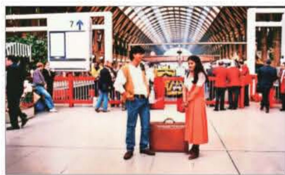
DDLJ was famously shot extensively in the UK, including a key scene at London's King's Cross Railway Station where the film's lead pair - Shah Rukh & Kajol - met for the first time

DDLJ has the distinction of being the longest-running title