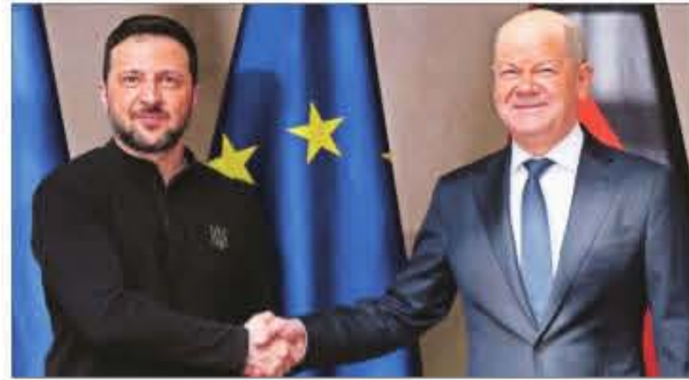
(Left) Ukrainian President Volodymyr Zelenskyy & German Chancellor Olaf Scholz at Munich Security Conference

Ramping up his desire for a more muscular and mighty Europe, Zelenskyy said Ukraine's three-year fight against an invading Russian army has proved that a foundation exists for the creation of a European army that has long been discussed among some continental leaders.