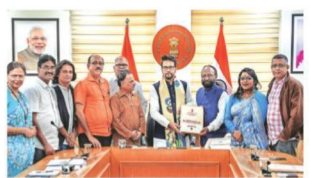
Union I&B Minister Anurag Singh Thakur with the jury members in New Delhi on Thursday.

The Kashmir Files, directed by Vivek Ranjan Agnihotri, also won the Nargis Dutt award for best film on national integration.