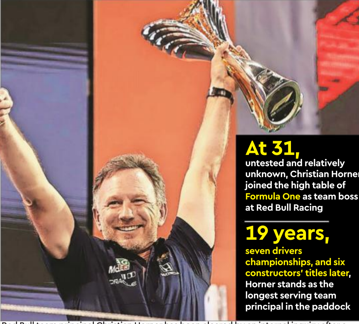
Red Bull team principal Christian Horner has been cleared by an internal inquiry after a female employee alleged inappropriate behavior but his future hangs in balance

A lack of transparency allowed the rumour mill to take over, and what had begun as reports of complaints with