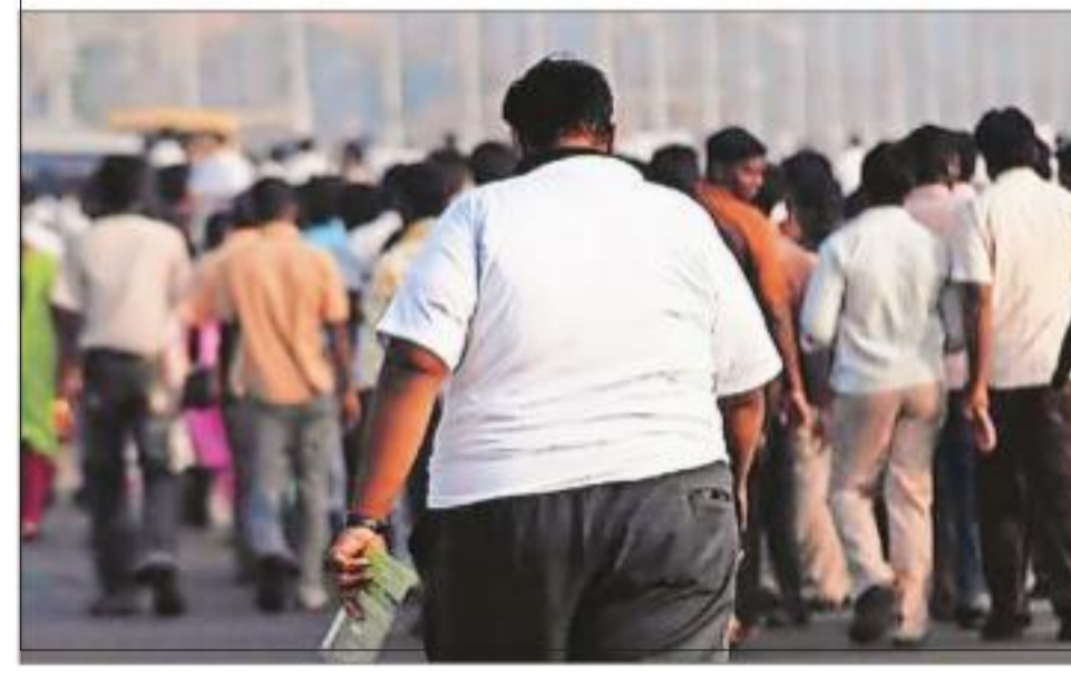
OBSESITY RATES AMONG ADULTS HAVE DOUBLED SINCE 1990

WHO member states in 2022 adopted an obesity