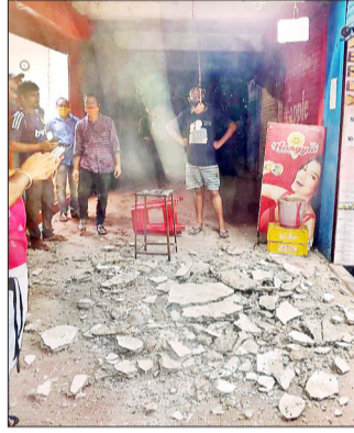
उसगाव : पीडीए मार्केट इमारतीचा कोसळलेला स्लॅब.

उसगाव : तिसक-उसगाव येथील पीडीए मार्केटच्या छप्पावरील स्लॅबचा काही भाग बुधवारी रात्री कोसळून पडला. या घटनेमध्ये एक युवक जखमी झाला असून त्याला उपचारासाठी पिळये आरोग्य केंद्रात पाठविले. पीडीए मार्केटमध्ये नियमित बाजार भरत असून ग्राहकांची कायम या ठिकाणी येणे जाणे असते. मार्केटची इमारत जुनी झाल्याने स्लॅबचे तुकडे पडू लागले आहे. ग्राहकांबरोबरच मार्केटमध्ये बसणाऱ्या व्यापाऱ्यांच्या जीवाला धोका निर्माण झालेला आहे.