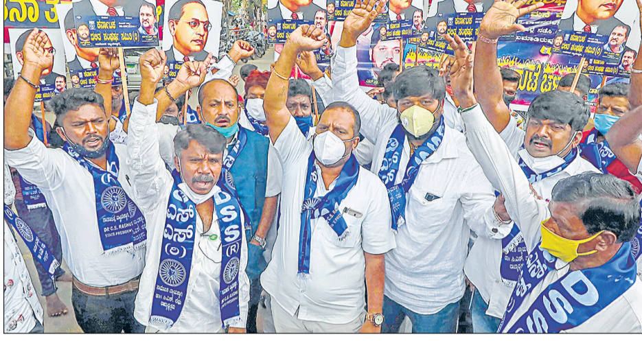
बेंगलुरु में हुई हिंसा के खिलाफ शुक्रवार को विरोध-प्रदर्शन करते दलित संघर्ष समिति के कार्यकर्ता। • प्र

बेंगलुरु हिंसा में पुलिस ने बड़ी कार्रवाई करते हुए कांग्रेस की पार्षद के पति समेत 60 और लोगों को गिरफ्तार किया है।