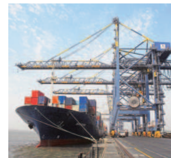
Merchandise exports dipped for fifth straight month in July by 10.2%.