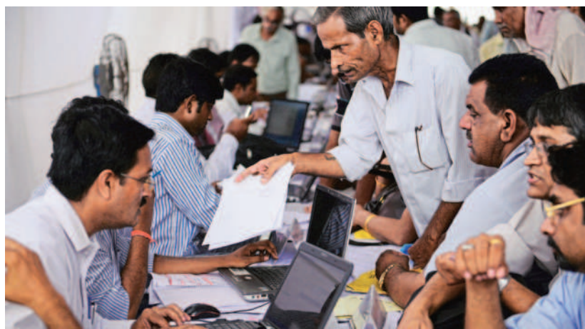
Of India's population of over 1.3 billion, only around 15 million have a net tax outgo. MINT

The change in personal I-T slabs announced in the interim budget of 2019, and subsequently retained in the Union budget in July, also led to lower tax collections. The change was made to give relief to individuals with income of up to ₹5 lakh, who will have to file returns but not pay tax. "This has benefited about 20 million people," said a second official, also requesting anonymity. The number of people declaring taxable