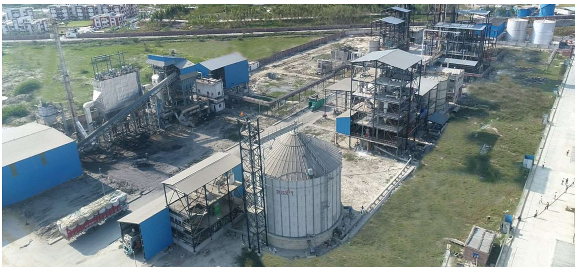
Sandila Plant, Dist Hardoi (U.P.)

Due to this the company diversified into liquor business and set up Bottling Plant for Indian Made Foreign Liquor (IMFL) at Sandila, Dist. Hardoi, Uttar Pradesh which commenced commercial production in July 2020. The Company also set up Distillery unit as a backward integration of Bottling Plant. The Distillery unit commenced commercial operations in September 2023.