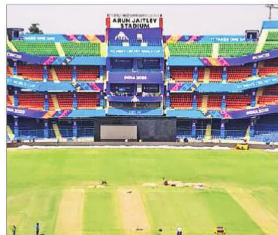
The Arun Jaitley Stadium is the home ground of DDCA