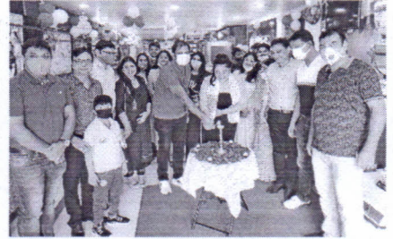
Staff reporter, Guwahati August 10:

Circuit City has announced a mega offer for the customers on the occasion of its 7th anniversary amid the ongoing Corona pandemic for the last one and a half years. On the occasion of 7th anniversary customers will get a discount and upto 20% cashback on the occasion of its 7th anniversary amid the ongoing Corona pandemic for the last one and a half years. On the occasion of 7th anniversary customers will get a discount and upto 20% cashback on the occasion of its 7th anniversary amid the ongoing Corona pandemic for the last one and a half years.