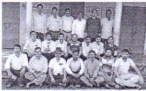
Correspondent, Orang, August 10: