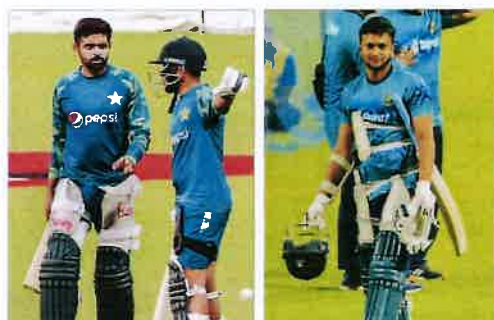
Which team would the Eden Gardens crowd support? Despite their common links, when Bangladesh encountered Pakistan in the T20 World Cup in 2016, they vociferously supported the latter. How they would behave on Tuesday is still a mystery.

Unlike the other Southeast Asian cricket-bloc rivalries, there have not been too many moments of scandals, though