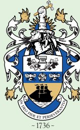
- 1736 - THE WADIA GROUP