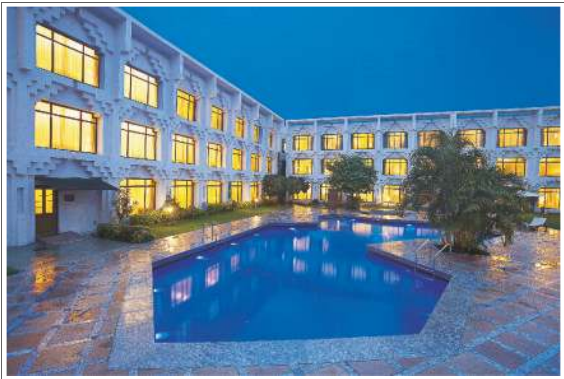
Pool Side View