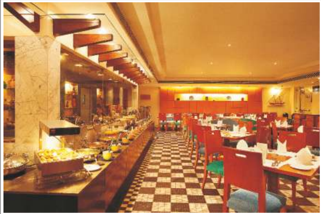
Welcomcafe Cambay 24x7 Fine Dining restaurant