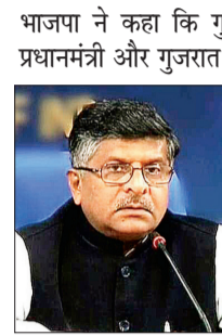
तत्कालीन मुख्यमंत्री नरेंद्र मोदी और 63 अन्य लोगों को विशेष जांच दल (एसआईटी) द्वारा

गुजरात दंगों को लेकर मोदी के खिलाफ चलाया गया फर्जी कैंपेन: भाजपा