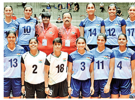
11 भारत की महिला टीम ने सिंगापुर को रौंदा