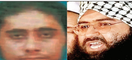
मीर को दी गई सात लेवल की सुरक्षा

26/11 मुंबई आतंकी हमले का मास्टरमाइंड साजिद मीर जिंदा है। पाकिस्तान ने पहले उसे मृत घोषित कर दिया था लेकिन अब उसे अरेस्ट करने का दावा किया है। वहीं, बहानेबाज पाकिस्तान का कहना है कि जैश-ए-मोहम्मद के प्रमुख मौलाना मसूद अजहर के बारे में पता नहीं चल रहा है। उल्लेखनीय है कि पाकिस्तान ने हमेशा से साजिद मीर की मौजूदगी से इंकार किया है और अब यह बताकर क्या साबित करना चाहता है या अपने दामन पर लगे दाग को मिटाना चाहता है, यह अपने आप में बड़ा सवाल है। साजिद मीर पर 2008 के शेष पेज 5 पर