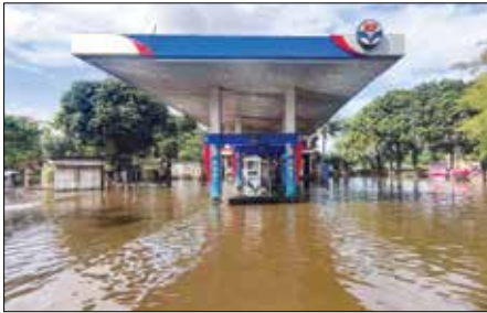
A partially submerged petrol pump during floods in Kamrup district, on Friday