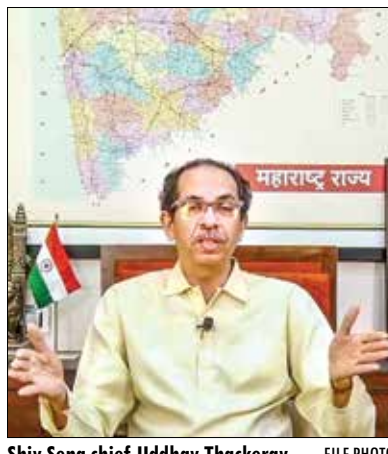
Shiv Sena chief Uddhav Thackeray

Shiv Sena, meanwhile, has called for a national executive meeting at 1 pm on Saturday which the CM will attend via video conference.