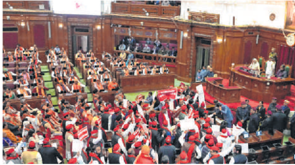
SP MLAs and MLCs raise slogans during a joint sitting of UP Legislative Assembly on first day of Budget session on Friday

The budget session of the Uttar Pradesh assembly, on Friday, opened to chants of 'Jai Shri Ram' as all legislators of BJP and its allied parties trooped wearing saffron scarves.