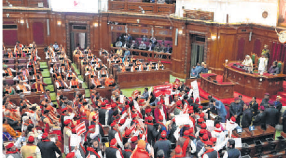
SP MLAs and MLCs raise slogans during a joint sitting of UP Legislative Assembly on first day of Budget session on Friday

The budget session of the Uttar Pradesh assembly, on Friday, opened to chants of 'Jai Shri Ram' as all legislators of BJP and its allied parties trooped wearing saffron scarves.