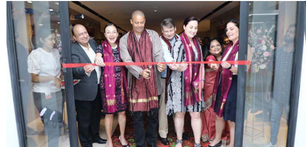
CEO, F5, "The opening of our engineering centre in Bengaluru will enable F5 to fully tap into local talent to help deliver innovative multi-cloud application solutions to our global customer base," he added.

Bengaluru, May 22 (IANS) F5, a global leader in multi-cloud application security and delivery, on Monday opened its new engineering centre here that will help drive research, development and product innovation.