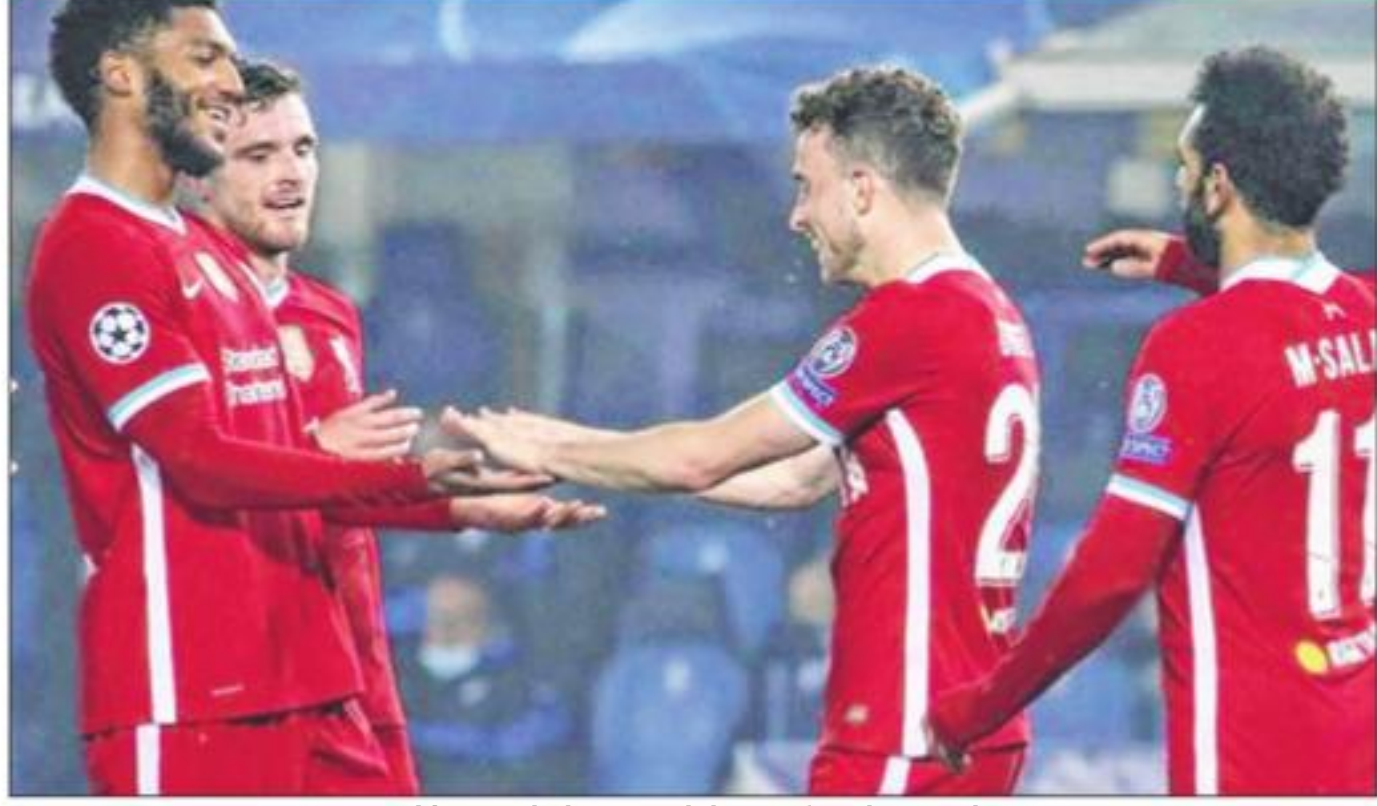
Liverpool players celebrate after the match

Elsewhere on the third match day of the group stage, 13-time champion Real Madrid beat visiting Inter