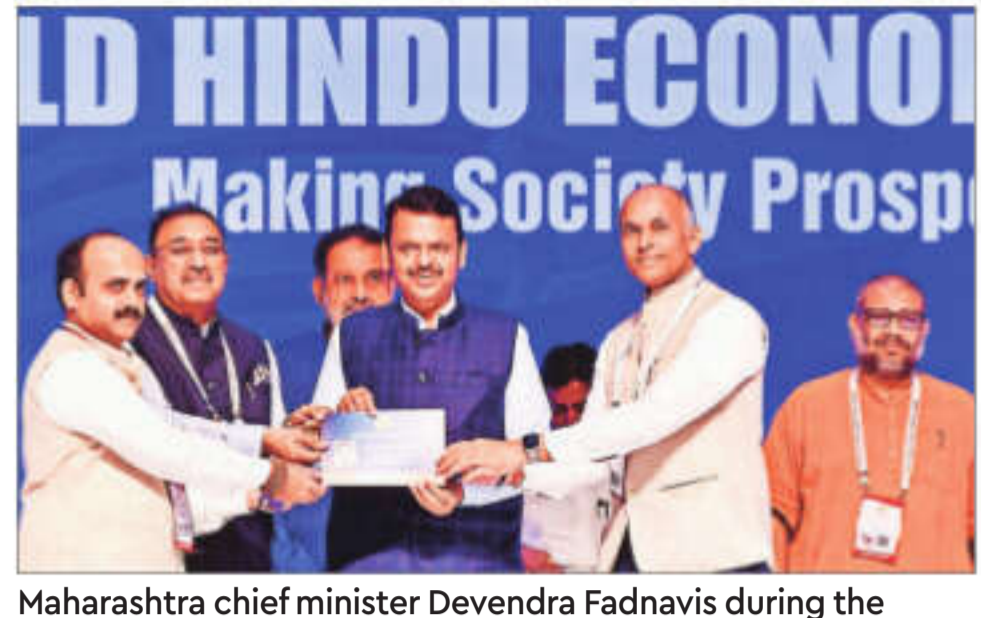
Maharashtra chief minister Devendra Fadnis during the annual conference of the World Hindu Economic Forum, at Jio World Convention Centre in Mumbai, on Friday

PRESS TRUST OF INDIA Mumbai, December 13 SEBI SHOULD WRITE regulations in such a way that people do not disagree and end up challenging decisions in the Securities Appellate Tribunal, a senior official said on Friday.