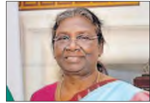
Droupadi Murmu

External affairs minister S Jaishankar visited the British high commission in New Delhi on September 12 to convey India's condolences. "In the 70 years of reign of