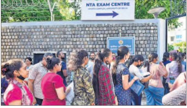
NTA said 1,490,000 candidates registered for the exam and consolidated attendance of 60% was reported.

A total of 1,490,000 candidates had registered for the examination and consolidated attendance of 60% was reported across six phases.