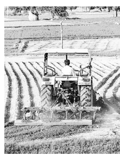
Part of the difference between industrial data and employment data can be explained by the fact that the former does not tell us anything about the agricultural sector

By the end of June, kharif sowing was twice its level a year ago. By the end of July, the lead narrowed down to 14 per cent. Therefore, while industrial data shows a spurt in activity in May and a slowing down of growth in June, rural activities show a spurt in May and a much bigger rise in June followed by a slower growth in July.