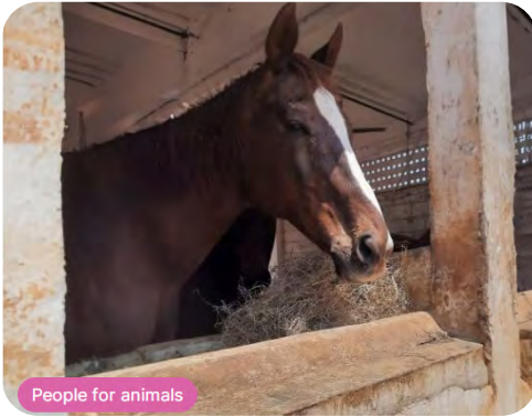
People for animals

Our CSR initiatives are aligned with our larger goals, and every step we take is to make a meaningful difference on communities, animals and the environment.