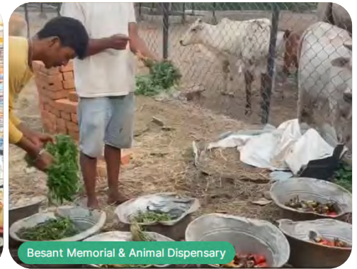
Besant Memorial & Animal Dispensary